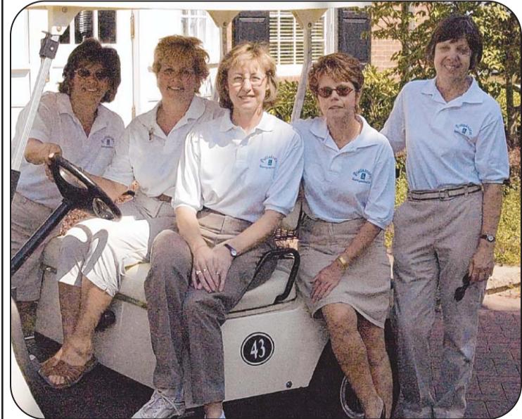
Connection photo by Tiffany Neafcy

The Soroptimist International Club of Pottstown held its annual golf outing on Monday, Sept. 19, at the Belwood Golf Course, Pottstown.