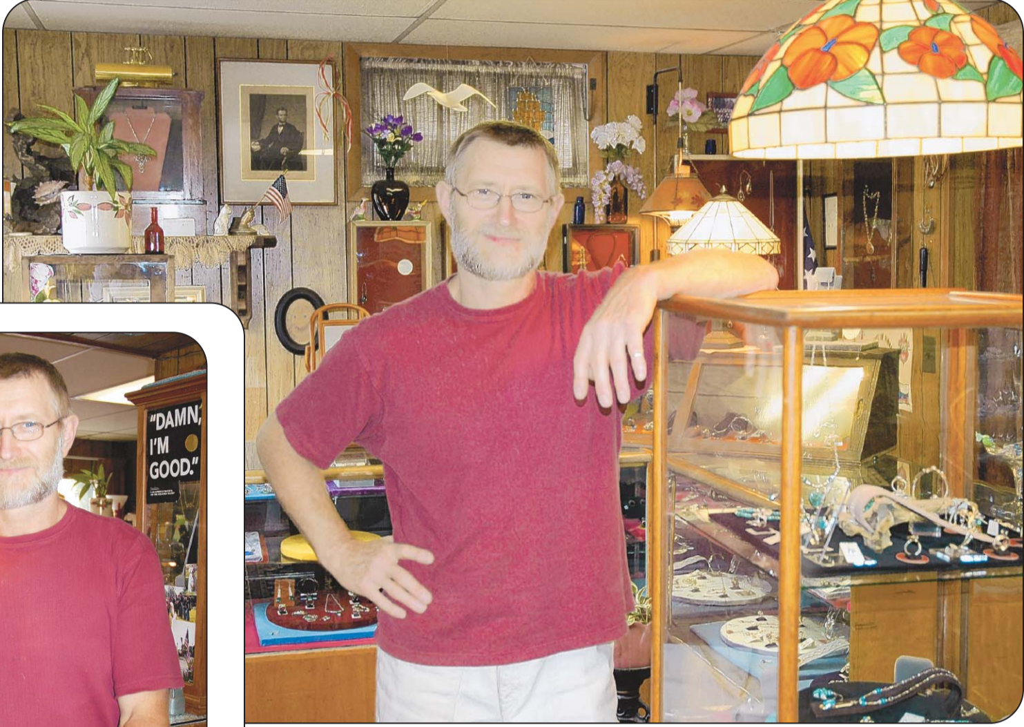
Connection photo by Harold Hoch

Many of the Silver Shoppe's merchandise range from $10 to $65. Most of the silver handmade jewelry is under $100,