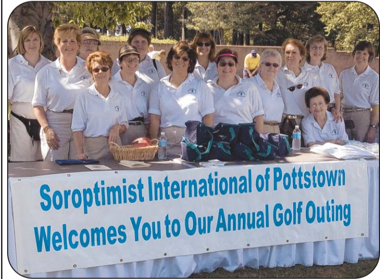
Connection photo by Tiffany Neafcy

The Soroptimist International Club of Pottstown held its annual golf outing on Monday, Sept. 19, at the Belwood Golf Course, Pottstown.