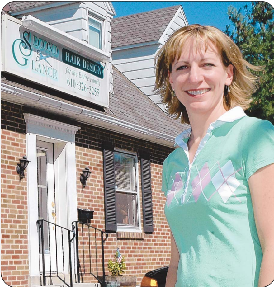
Connection photo by Harold Hoch