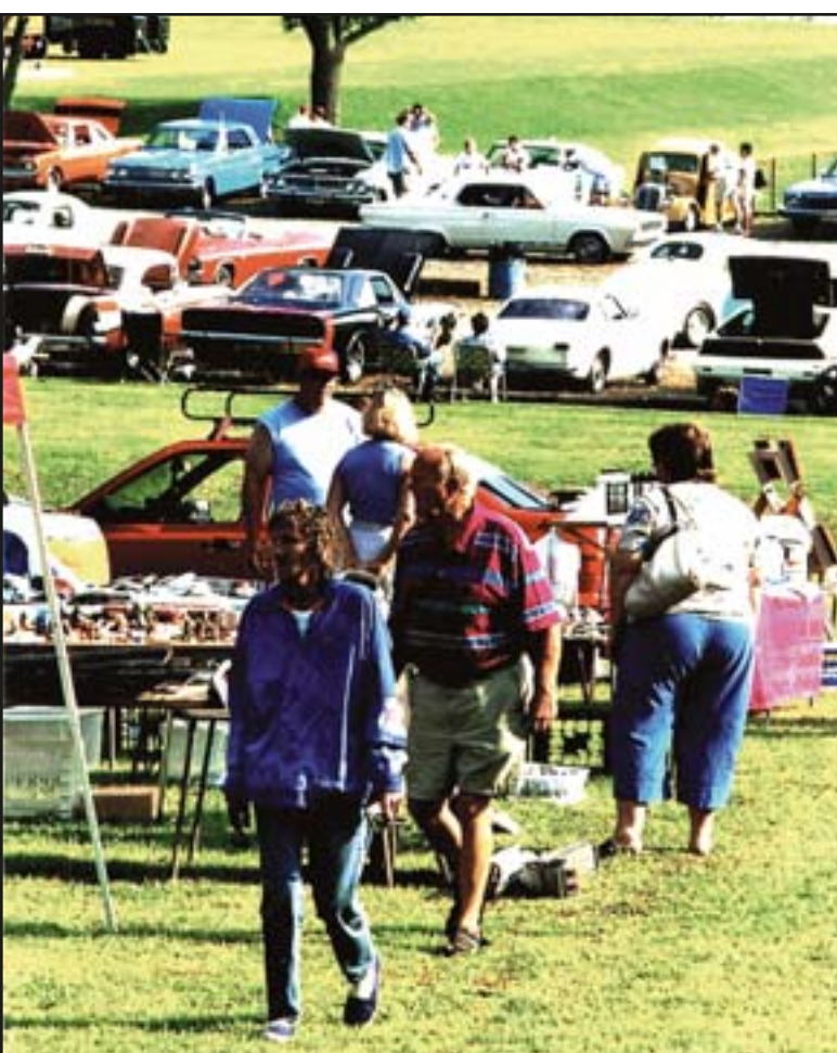
Flea market, spare parts and great people.