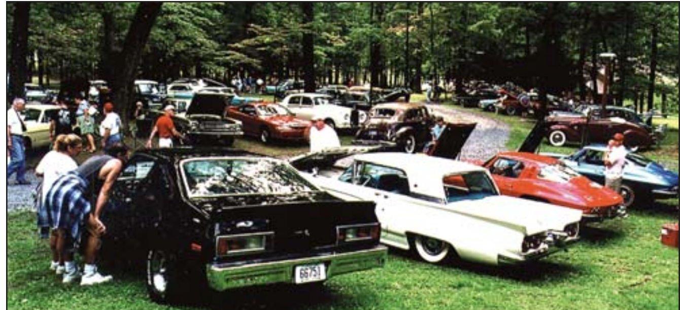
The annual gathering of classic automobiles was held Saturday, September 4 in Boyertown.