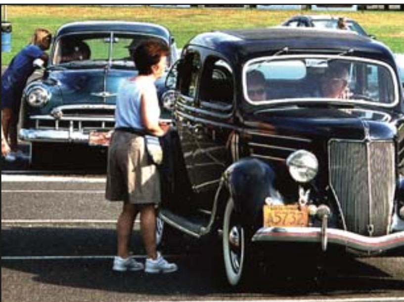
The registration line was the first stop at the Duryea Day.