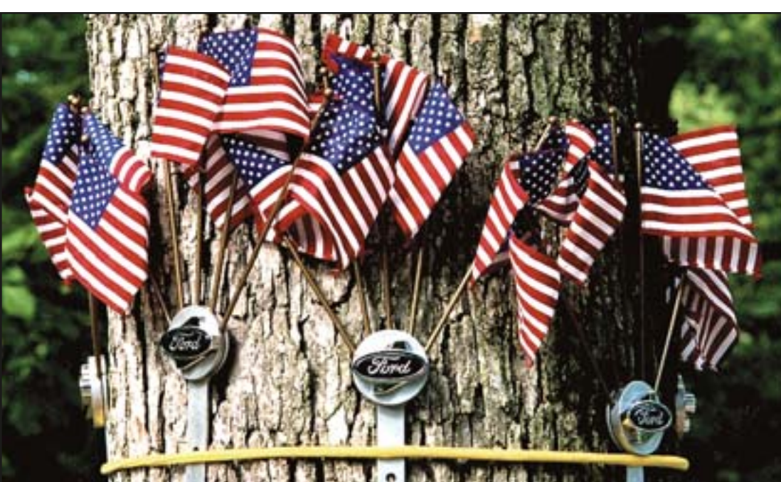
There was patriotism and auto memorabilia all around Boyertown Park.