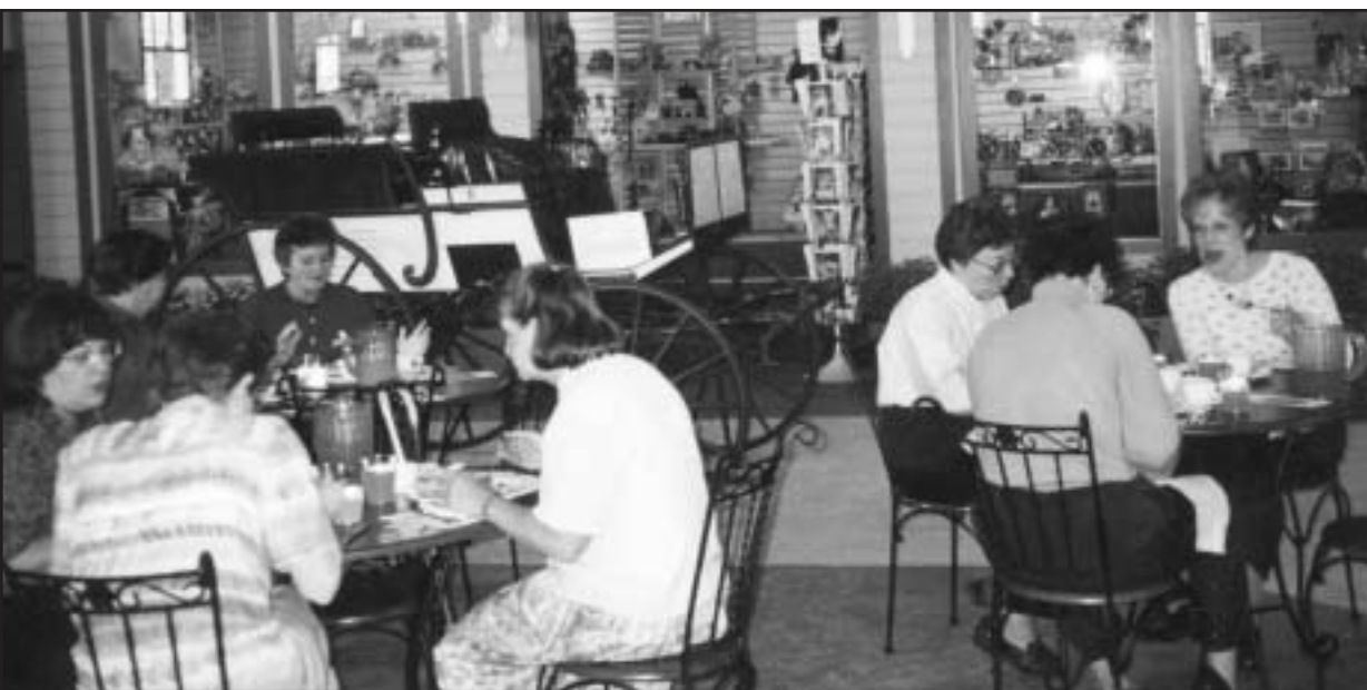
The Boyertown Museum of Historic Vehicles recently invited tourism professionals to lunch, to see and experience the museum, in an effort to expand tourism to the museum. Lunch was catered by Bause-Landry catering of Pottstown.

In addition to demonstrating safety devices, the firemen were taught about the differences in storage tanks, shut-off steps, the differences in delivery vehicles, and the new LP valve currently being phased into use was also shown.