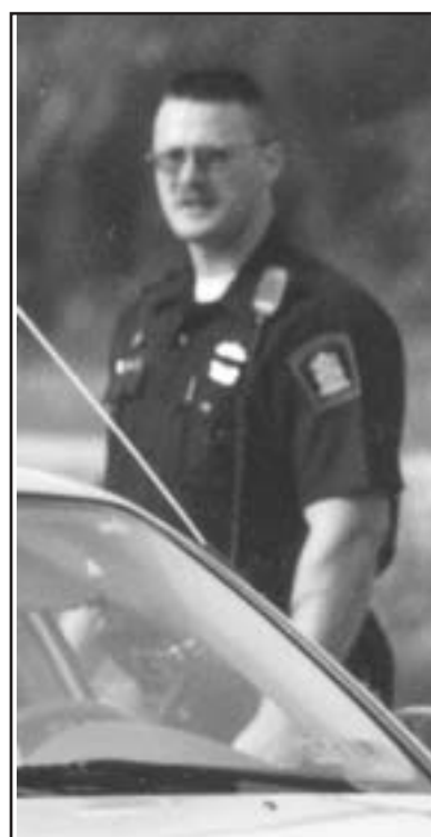
On Saturday, September 22, the Gilbertsville Fire Company and The Douglass Township Police (Montgomery County) took donations for the victims and families of the Pennsylvania Plane Crash, the World Trade Center and the Attack On The Pentagon. They set up at the intersection of Route 100 and Route 73 for two hours.