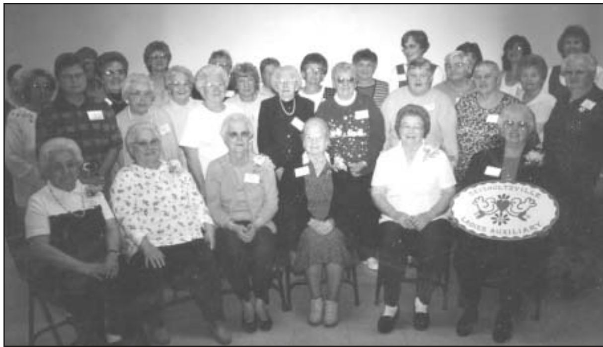
The Ladies Auxiliary of Seisholtzville takes a moment to slow down so all the members could pose for a photo.