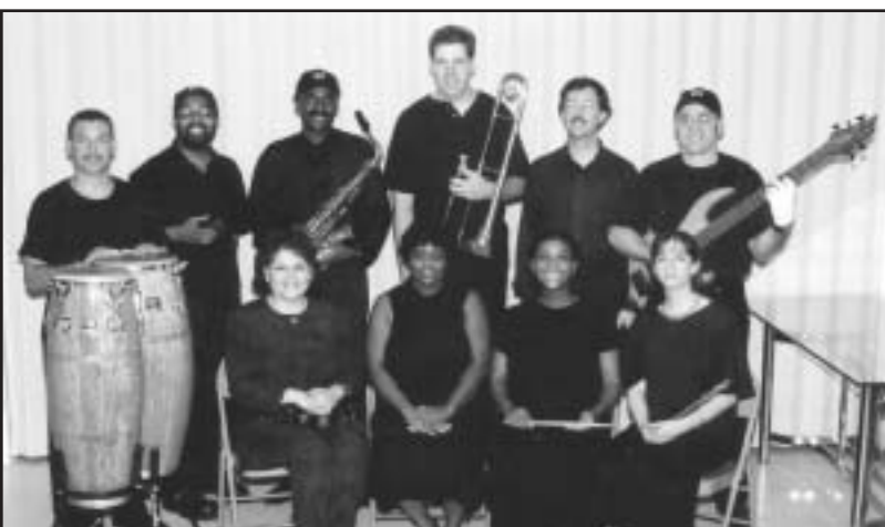
Pentecost will perform in Bally on September 22 from 7-9 p.m.

The praise band "Pentecost!" comes to the Bally Memorial Ballfield for an evening of praise and worship from 7 to 9 p.m. on September 22.